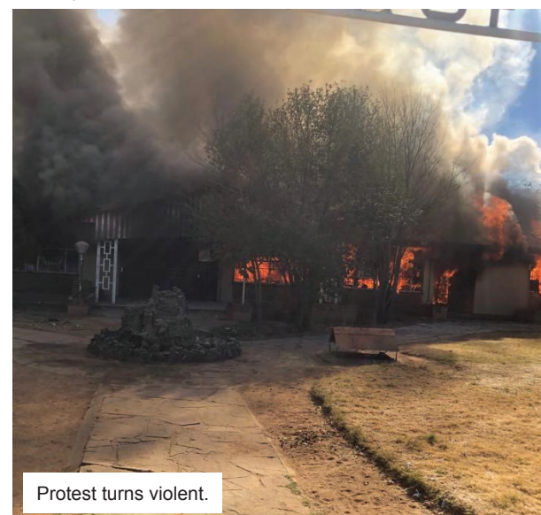
Protest turns violent.