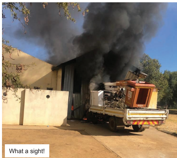
What a sight!

“At this moment we are unable to quantify the damages. It is very frustrating for local government when communities destroy their own facilities,” Dineo added.